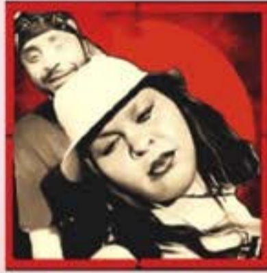
BY HIPPIE MANDY & KD-SMOOVE